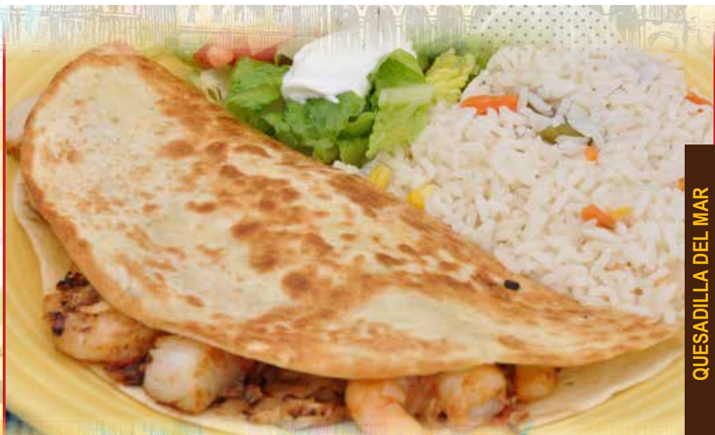
QUESADILLA DEL MAR

12-inch flour tortilla stuffed with shrimp, crab meat and scallops cooked with onions and tomatoes. Served with Spanish rice, lettuce and sour cream on the side – 17.95