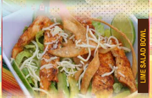
LIME SALAD BOWL