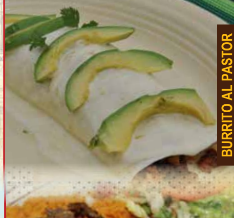
BURRITO AL PASTOR