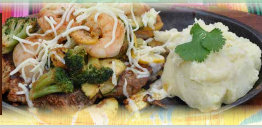
SIZZLING STEAK &amp; SHRIMP

Pork carnitas cooked with onions, tomatoes, green, yellow and red peppers – 14.95